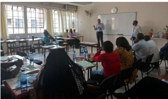
External Examiners feedback session during the September, 2022 Fellowship Examiners TTT held in Blantyre, Malawi