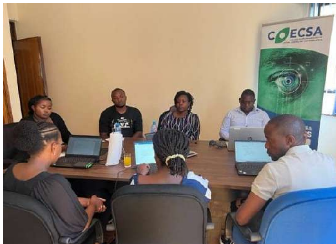
MoDRIA-Uganda and MoDRIA-Kenya teams holding a consultative meeting at COECSA Secretariate Boardroom in March, 2023