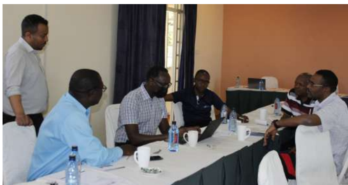
The Cornea & Anterior Segment Team during the curricula consultative meeting held at Lukenya Getaway, Nairobi, Kenya.

The development of the two curricula is expected to conclude by December, 2023.