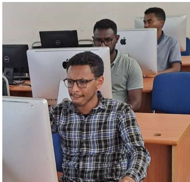
Some candidates at Mekelle University, Tigray, North Region, Ethiopia

One of the great successes of the exam is that it gave an opportunity to candidates from hard-to-reach areas such as Mekelle University, in Tigray, North Region of Ethiopia, to sit an international exam.