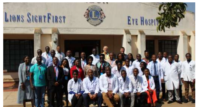
Candidates and Examiners during the 2022 Fellowship Exam in Blantyre, Malawi