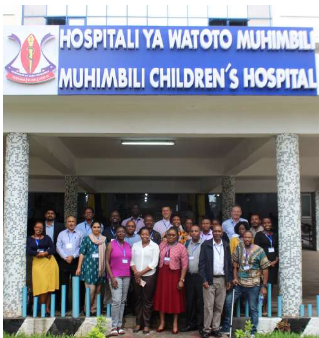
Taking a break: COECSA Examiners pose for a group photo during the April, 2023 Fellowship Exams held at MUHAS in Dar es Salaam, Tanzania. 26 candidates took the exam.

A total of 26 candidates were examined in Tanzania, and it was the second highest number of candidates examined prior to this exam.