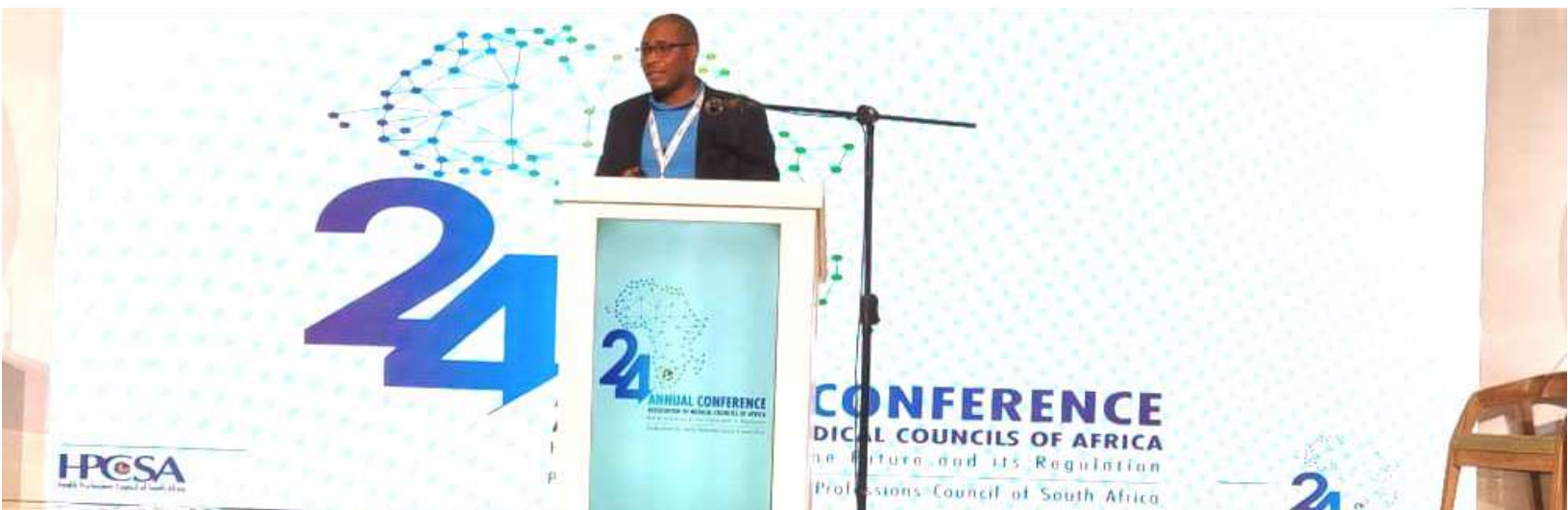
COECSA Presentation at the 24th International Conference of the Association of Medical Councils of Africa (AMCOA), Sun City, South Africa