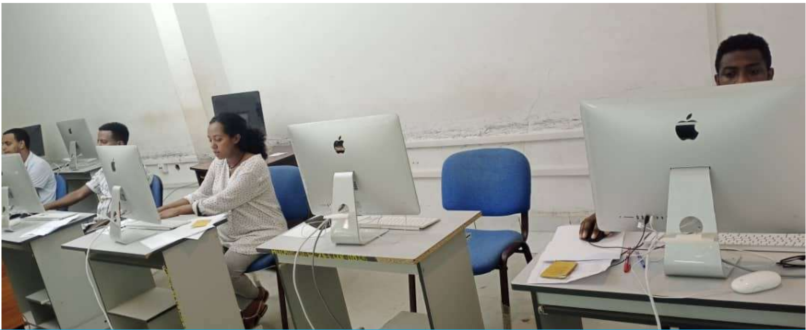
Some of the candidates during the June 2023 COECSA online Written Examination at Hawassa University, Ethiopia.