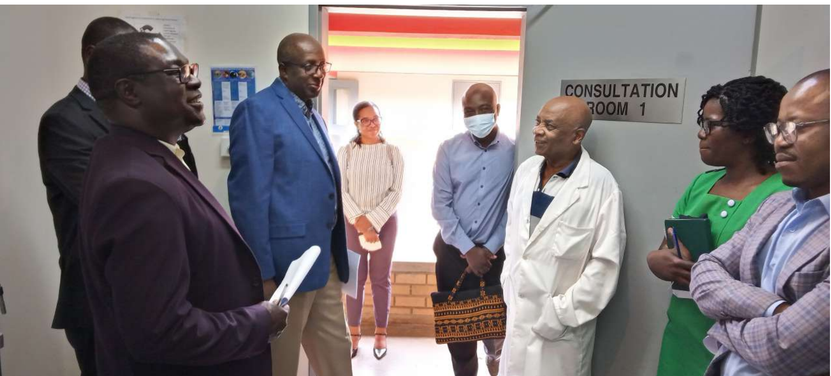
The COECSA Accreditation Team undertaking a guided tour of the United Bulawayo Hospitals (UBH) in Zimbabwe.