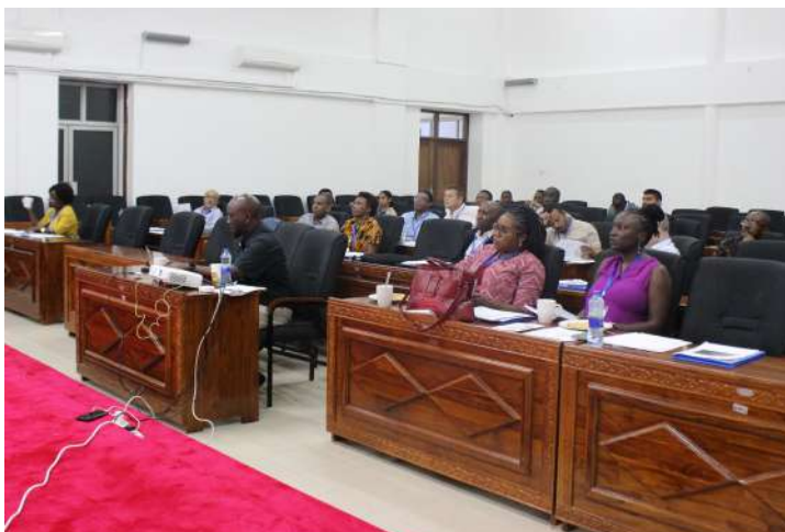
Participants in the April, 2023 Fellowship Examiners TTT held at MUHAS, Dar es Salaam, Tanzania