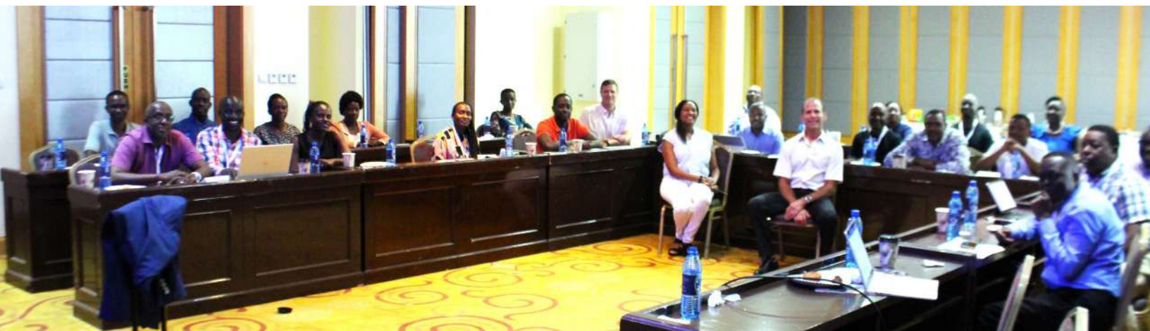
Participants and Facilitators for COECSA Question Writers TTT held at BICC, Lilongwe, Malawi in September, 2022

The main objective of the COECSA Train the Trainers (TTT) program is to enhance knowledge and strengthen the technical capacity of ophthalmic trainers to implement quality training programmes in general, and in particular the COECSA curricula and its assessments. The goal is to enhance standardization and quality of training across the region.