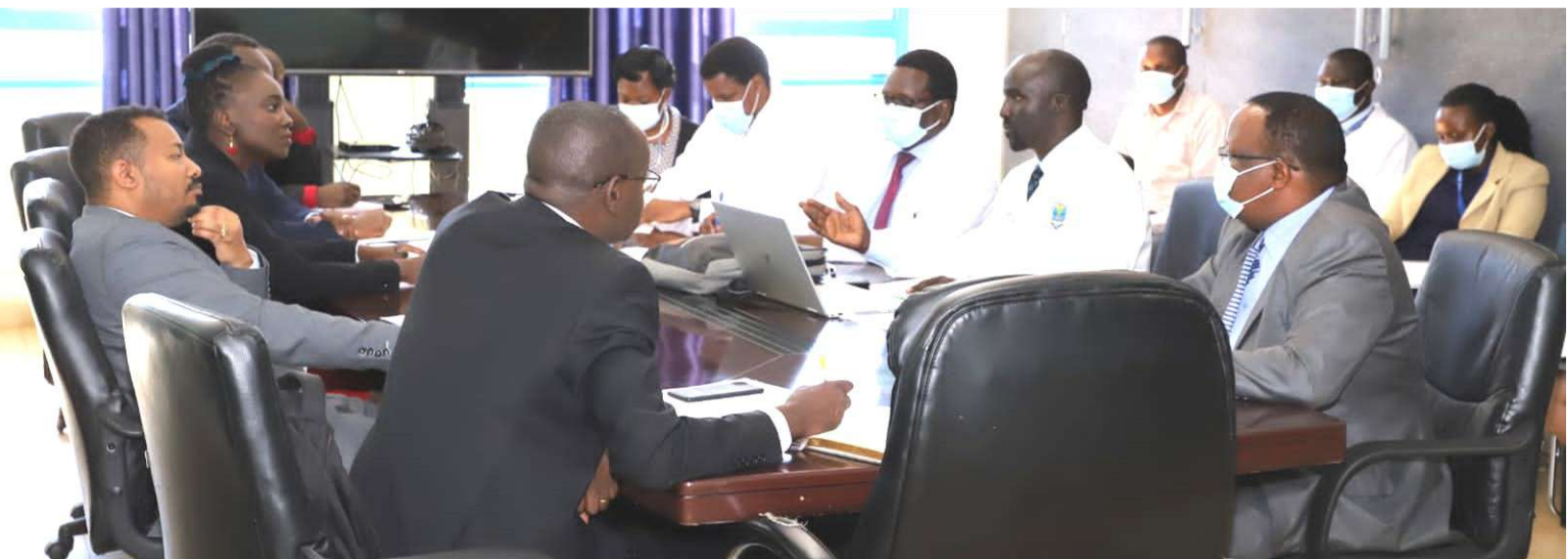
Accreditation consultative meeting between COECSA and Moi Teaching and Referral Hospital (MTRH) in Eldoret, Kenya.