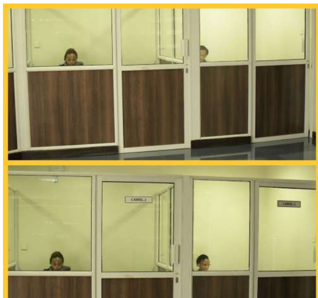
COECSA Online Exams at Kenya National Library Services, Nairobi, Kenya

Of the 132 admissions, 116 exams were successfully administered, while the difference represents candidates who were absent on exam day.