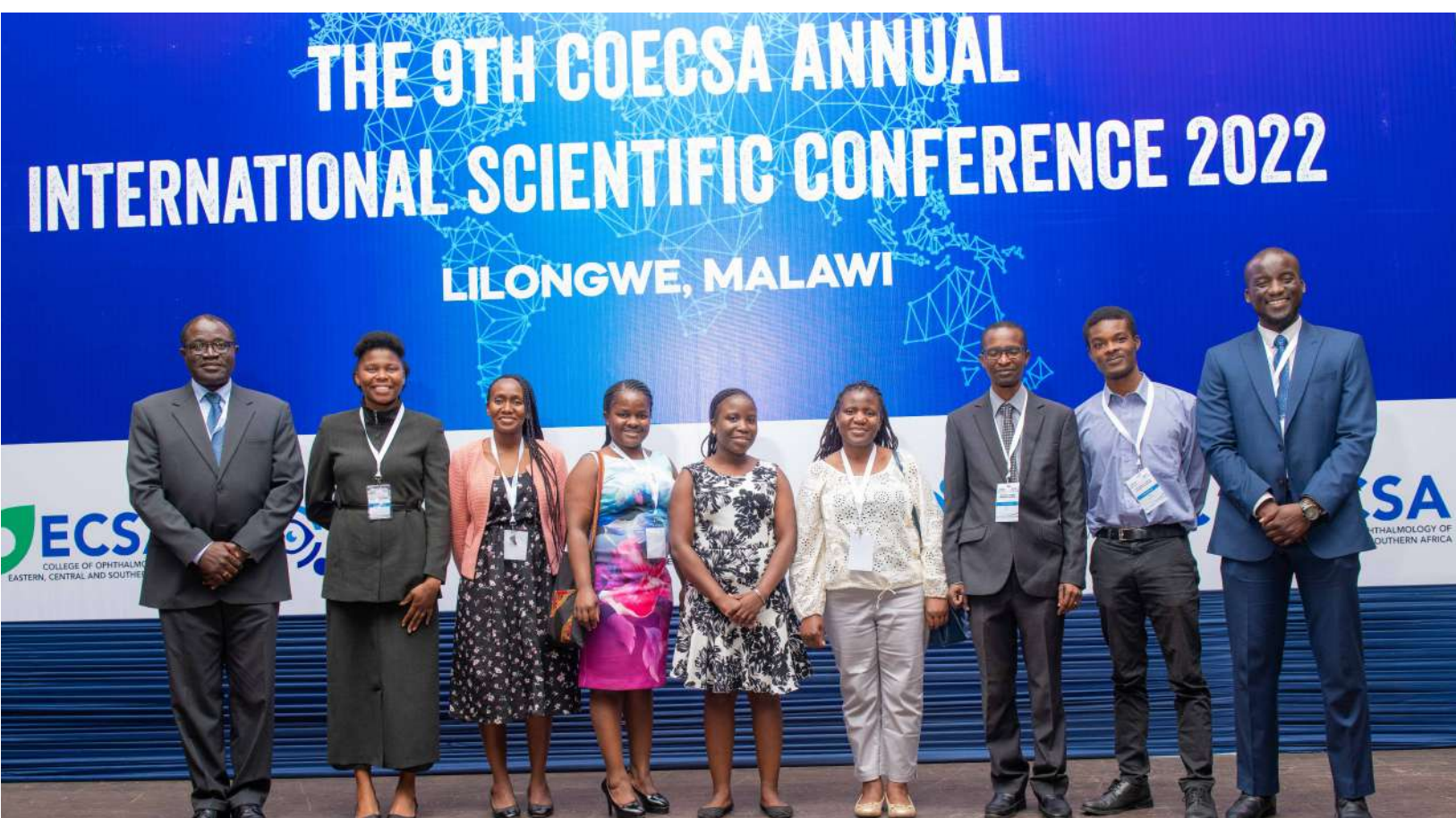
Members of the Ophthalmology Society of Malawi (OSM) hosts for 2022 COECSA Congress during the congress at BICC