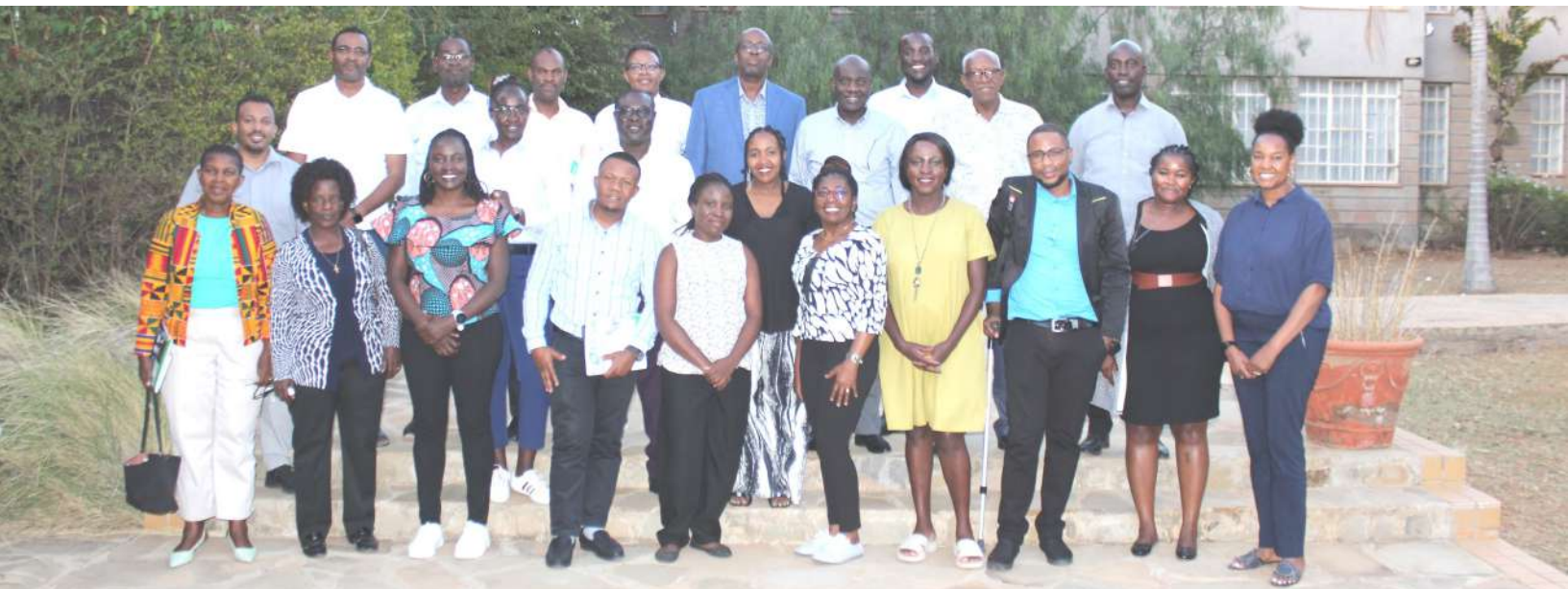
COECSA Council Members and Secretariate Staff during the Council Induction and Planning meeting held at Lukenya, Nairobi, Kenya, as part of HSS